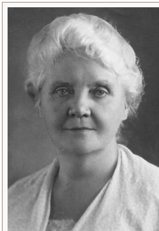
Dr. Ida Scudder, MD 1899.